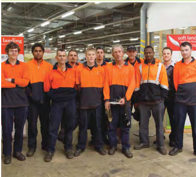
Soft Landing team, based in Wetherill Park, Fairfield LGA.

Soft Landing offers great social outcomes for Western Sydney, but also supports councils' reuse and recycling efforts by diverting old mattresses from landfill.