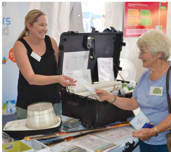
Light Years Ahead's Project Manager with resident at the Hawkesbury Show.

Over 80% of people surveyed about Light Years Ahead supported the program, believed it was important for Western Sydney and thought governments should be doing more of these sorts of initiatives.